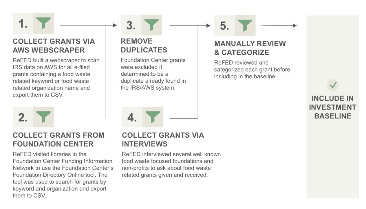
Figure 2 : The following diagram summarizes the process used to collect, review, and include grants in the baseline: